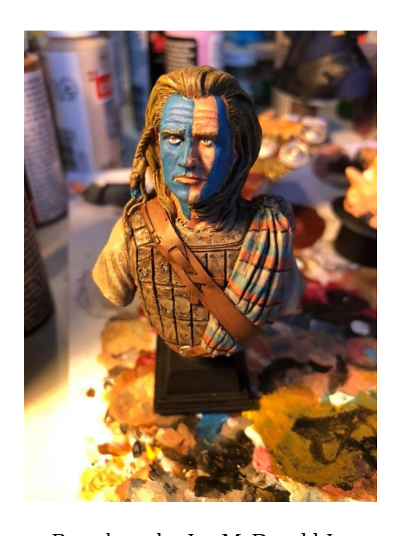
Braveheart by Joe McDonald Jr.

MassCar 2020 – Cancelled Wings & Wheels 2020 – Cancelled Downeastcon 2020 – Cancelled Northshore Con 2020 – Cancelled IPMS Nationals 2020 – Cancelled Patcon 2020 - Cancelled Granitecon 2020 – Cancelled BAYCON 2020 – Cancelled